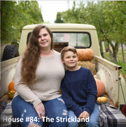
House #84: The Strickland