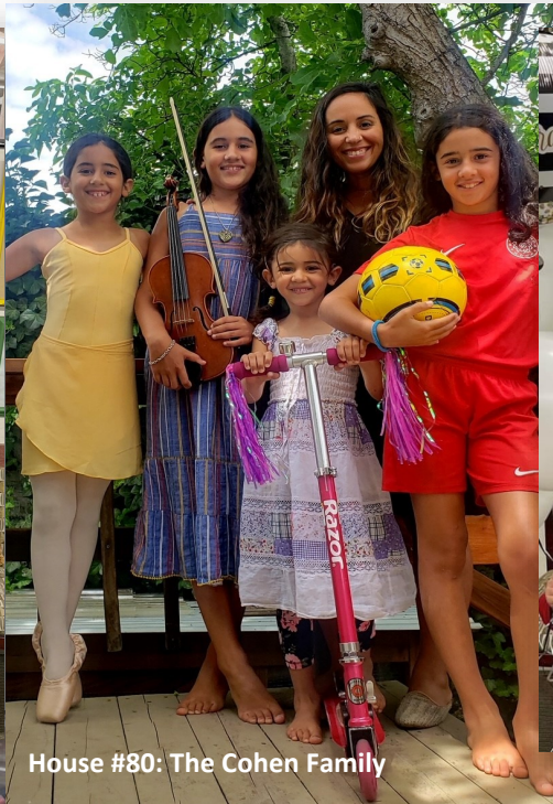
House #80: The Cohen Family