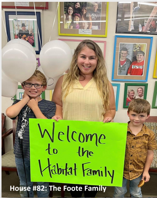
House #82: The Foote Family