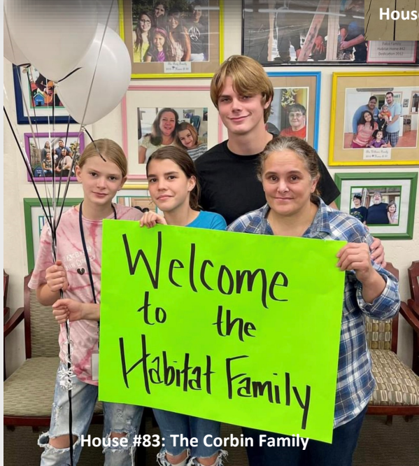
House #83: The Corbin Family